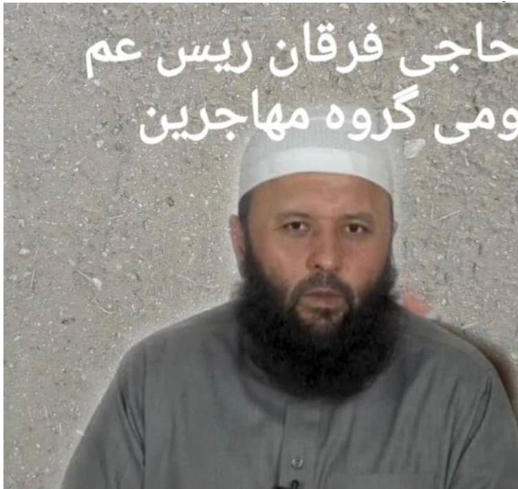
Recent – before the fall of Kabul in 2021